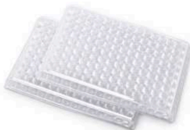
96 Well plates (2 Nos)